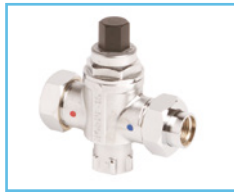
Scald Protection Valve