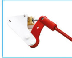
Shower Proximity Switch