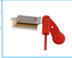
Eyebath Proximity Switch