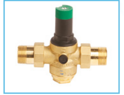
Pressure Reducing Valve