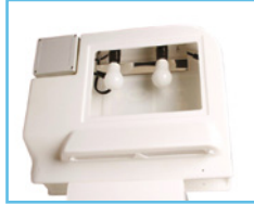
Lighting for Sign Box