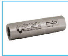
Freeze Protection Valve