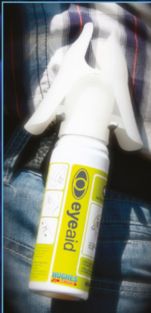
100ml aerosol bottle with belt clip